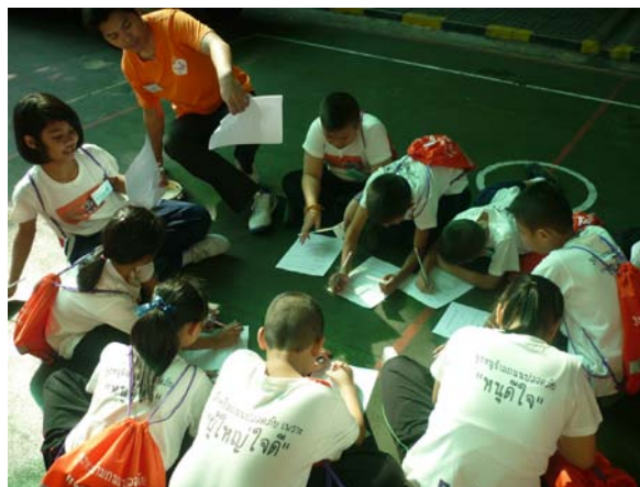
Walk Rally for Safety Pedestrian and Games