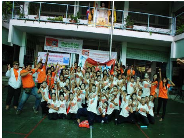
Teachers of Wat Pharya Yang school